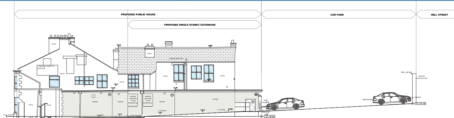
Proposed Front Elevation from Chorley Road